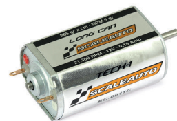
SC-0011C 20.000 Rpm Long Can. 185gr*cm. 0,18Amp