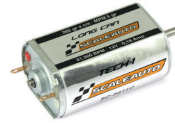
SC-0011C 20.000 Rpm Long Can. 185gr*cm. 0,18Amp