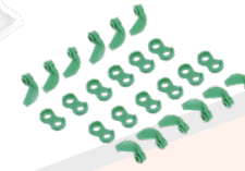
SC-6534 RT4 Chasis clips and suspension arms