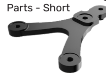
SC-6539A RT4 Extension Fixing Parts - Short